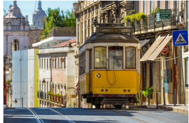
One of Lisbon's famous old trams in the city center

Do you want to visit Lisbon or any other city with us? Please contact our team by phone or email: +49 30 60275836 / info@abroadconsulting.eu*